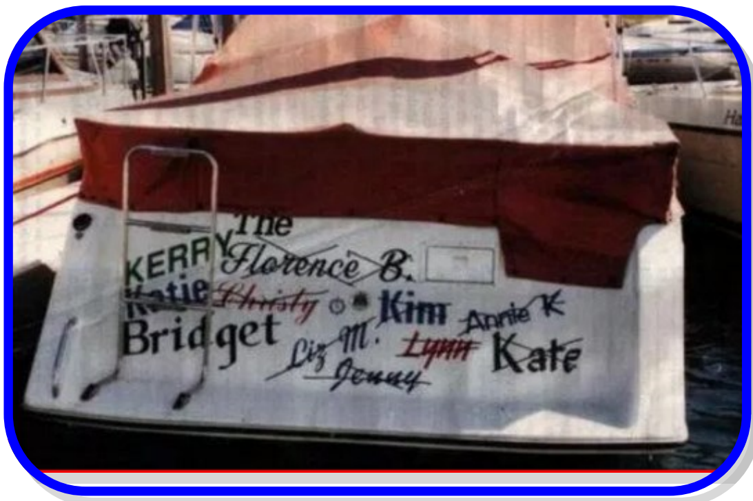
This guy must be a frequent visitor to “Plenty of Fish”