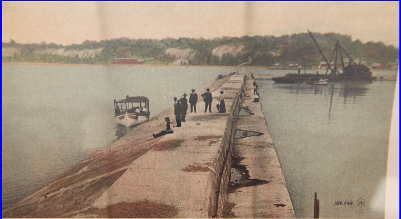
LOOKING NORTH FROM THE LIGHTHOUSE, ca. 1913