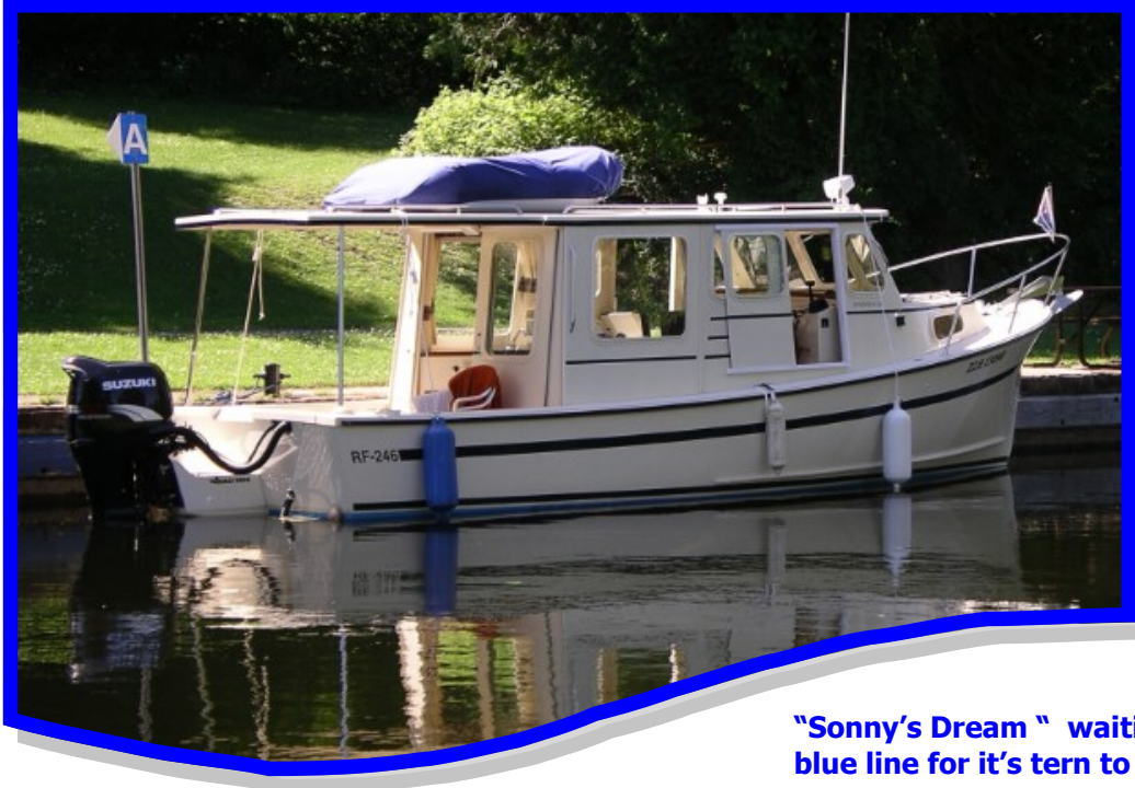
"Sonny's Dream " waiting on the blue line for it's tern to continue