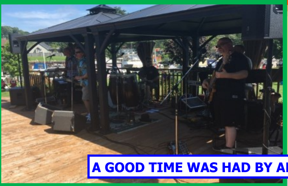
A GOOD TIME WAS HAD BY ALL