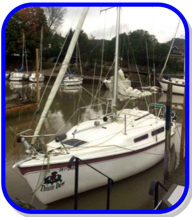
Steve's current sail boat "Thistle Dew" a 25 foot MacGregor which is docked at slip number 19.