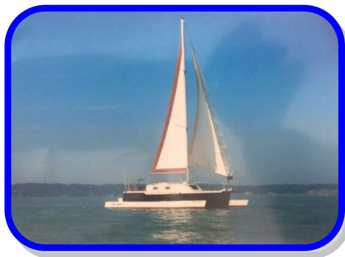
Another of Steve's 2 home made boats. This steel sail boat had folding out-riggers to increase stability, while allowing access to narrow channels and narrow docks.