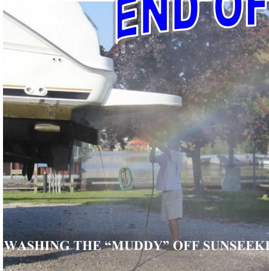
WASHING THE "MUDDY" OFF SUNSEEKER3