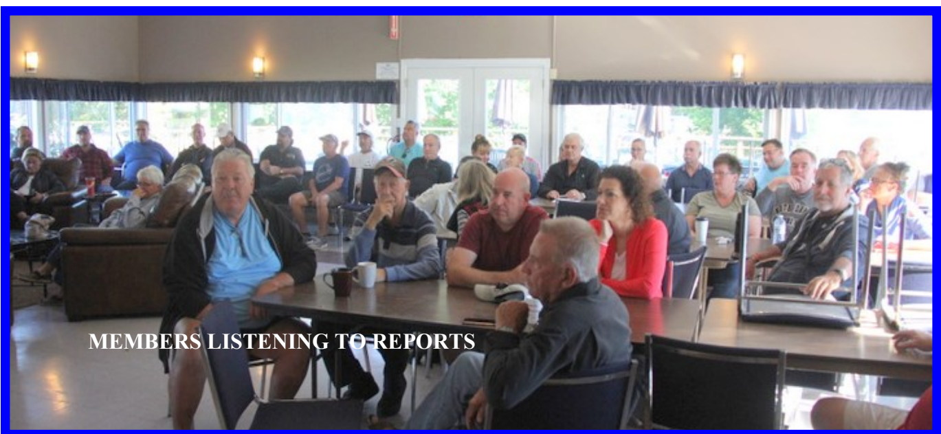
MEMBERS LISTENING TO REPORTS