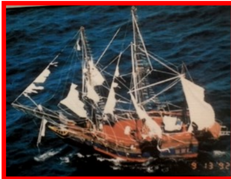
"The Golden Lion" in disrepair after encountering a hurricane which ripped all of the sails to shreds.