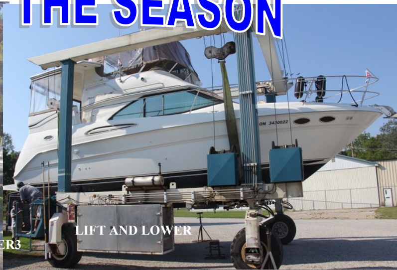
LIFT AND LOWER